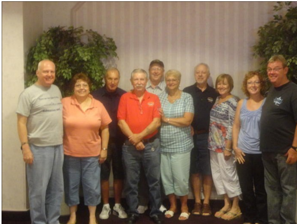
Piper Reunion 2011 - Radisson Hotel, New London, CT