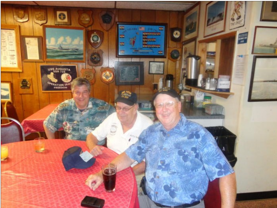
Piper Reunion 2011 - Groton Clubhouse